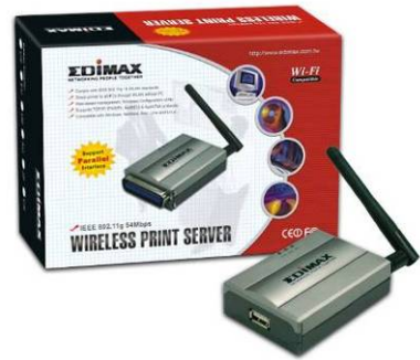
PS-1206UWg / PWg