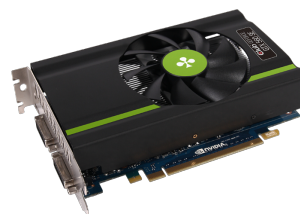
GeForce GTX 560SE graphic card