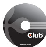
Driver & E-Manual CD