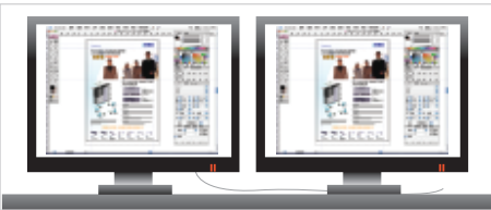
Art Graphic Designers