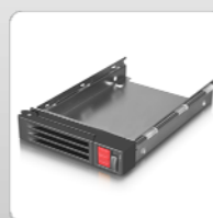
15mm Height Tray